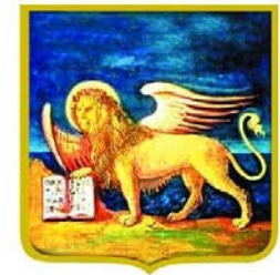
REGIONE DEL VENETO