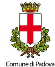
Comune di Padova